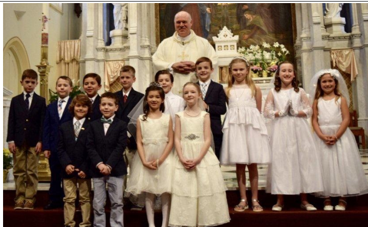
First Eucharist Celebrations. Above, May 4. Below, May 5.

These classes will be held in the evenings from 5:30–8pm. Registration forms are available. If you have not yet received one, please contact the Religious Ed. office.